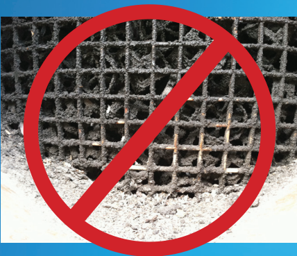
Interior surface of an odor control system without a proper pre-filter